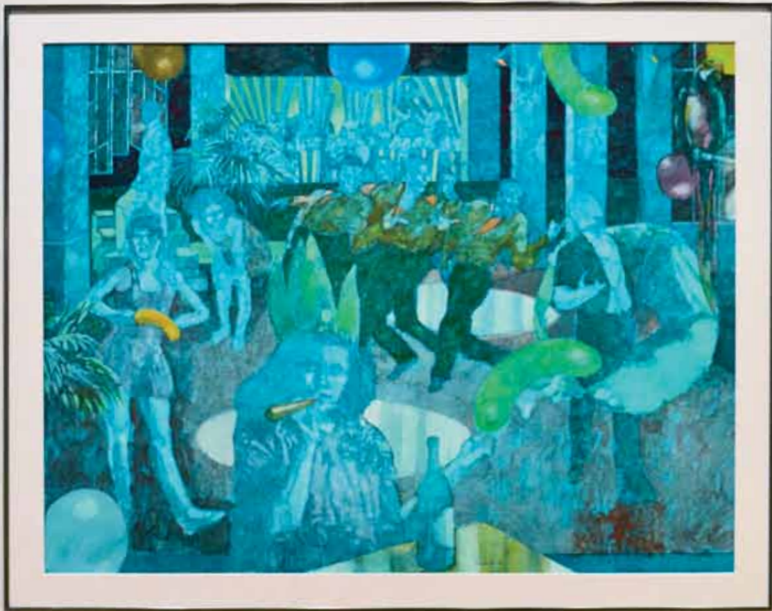
PHOTO COURTESY OF MS MUSEUM OF ART AND KEVIN BURFORD, ARTIST - BYRON BURFORD, "BEAUTY CELEBRATES NEW YEAR", 1987, MAGNA ON CANVAS